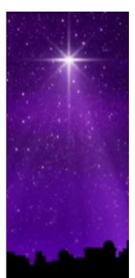
Ghe Advent of the (Dessiah